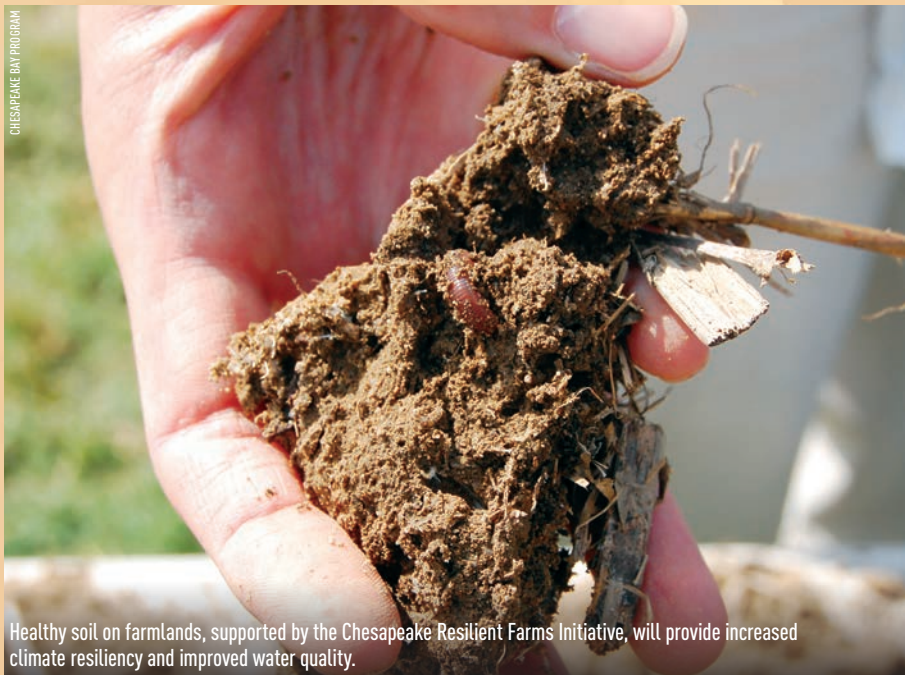
Healthy soil on farmlands, supported by the Chesapeake Resilient Farms Initiative, will provide increased climate resiliency and improved water quality.

Since the Commission’s creation, nutrient pollution has been reduced by 25 percent. According to current modeled estimates, an additional 50 million pounds of nitrogen pollution must be reduced to restore clean water. Eighty-five percent of those