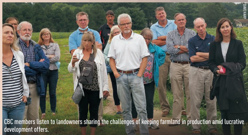
CBC members listen to landowners sharing the challenges of keeping farmland in production amid lucrative development offers.