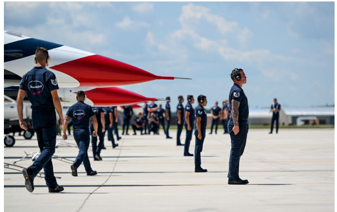
Air Force Thunderbirds practice at Joint Base Langley-Eustis

Focus on land concerns (encroachment, forest health, arable and conservation lands, fire/flood abatement) in the north, central, and southwestern regions and water quality concerns in the southeastern region, while ensuring complementary efforts across all regions.