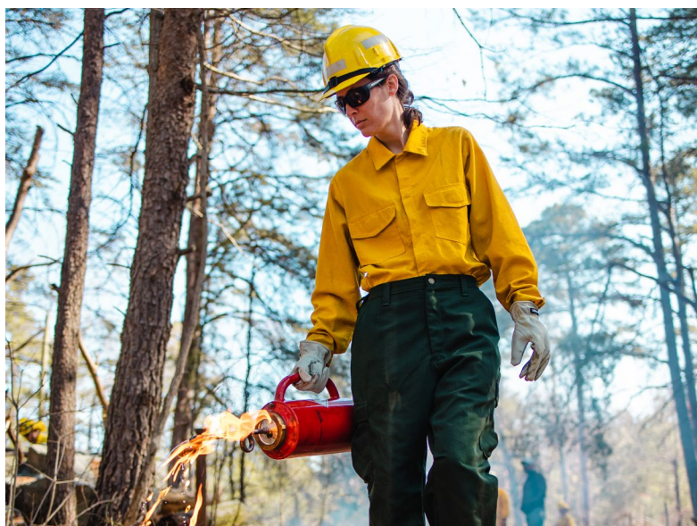
Controlled burn at Marine Corps Base Quantico