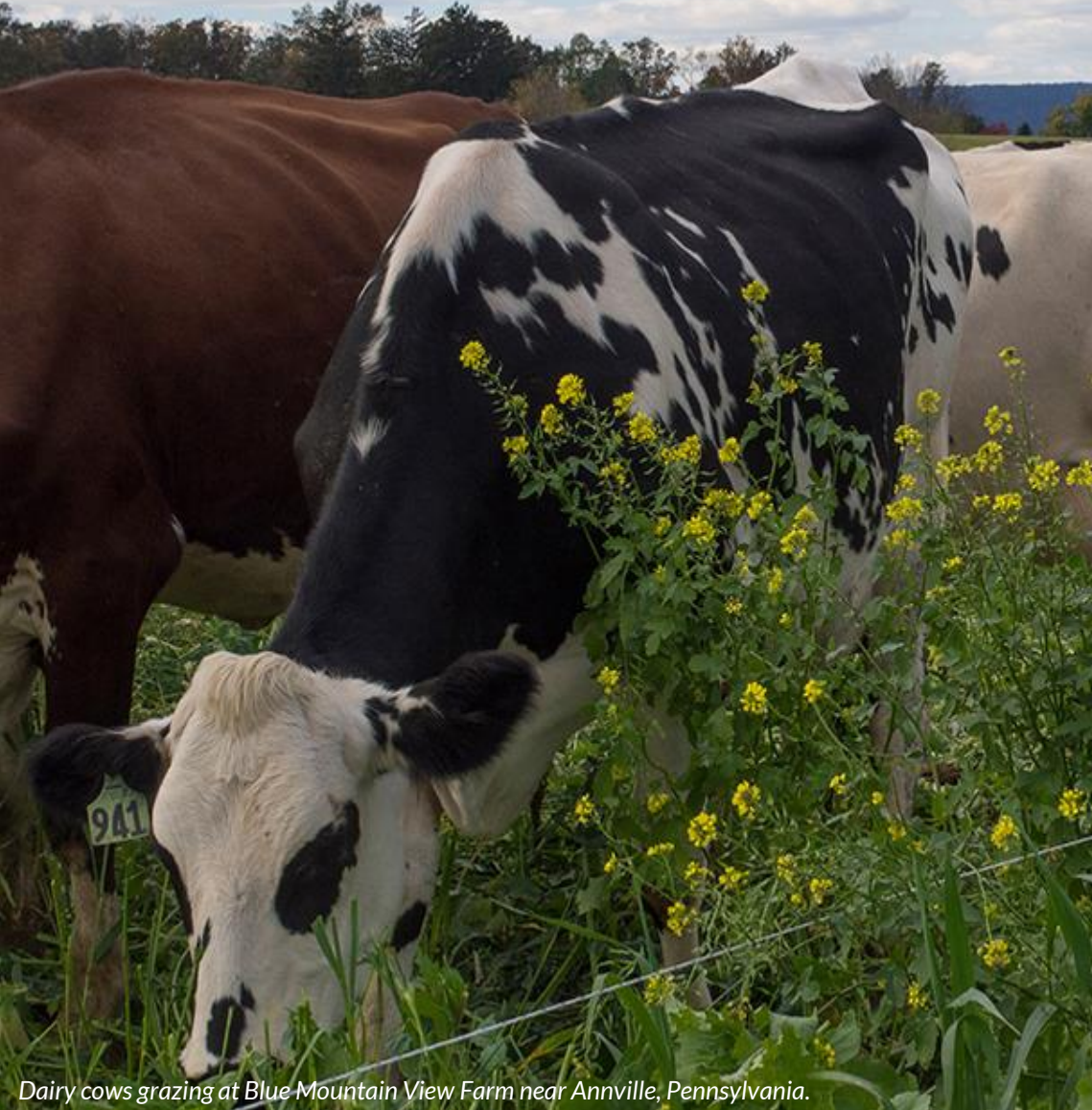
Dairy cows grazing at Blue Mountain View Farm near Annville, Pennsylvania.