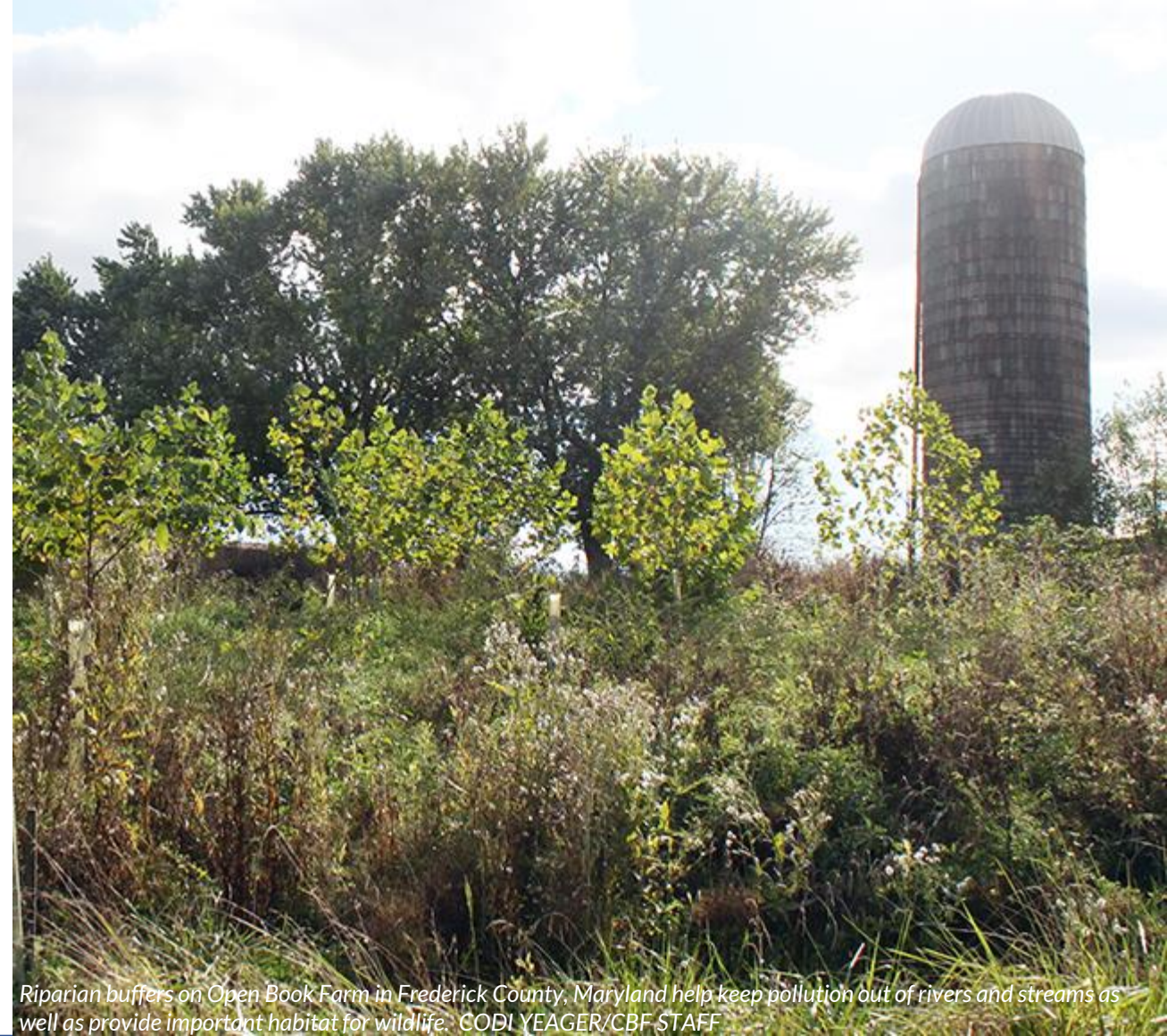
Riparian buffers on Open Book Farm in Frederick County, Maryland help keep pollution out of rivers and streams as well as provide important habitat for wildlife.